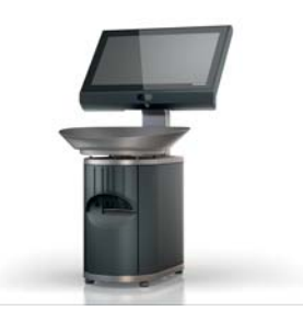
MC 500 table-top model